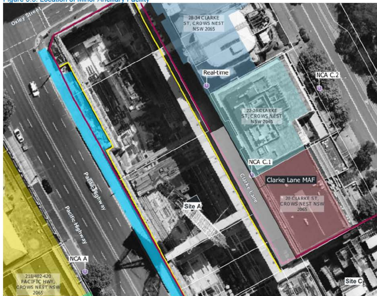
Figure 3.3: Location of Minor Ancillary Facility